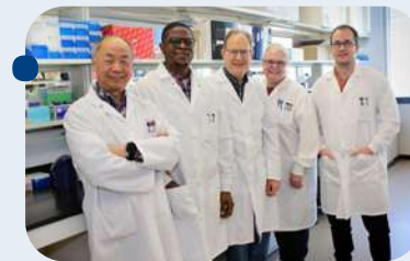
BREVITY RNA Dx Group Photo