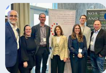
Annual Cancer and Aging Research Breakthrough Forum